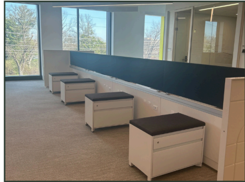
Area for Desks