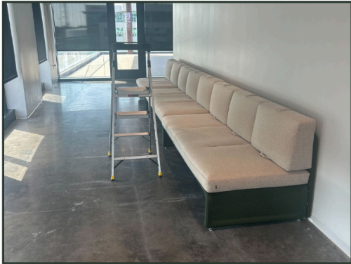
Common Area Furniture