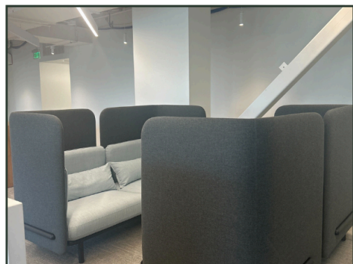
Common Area Furniture