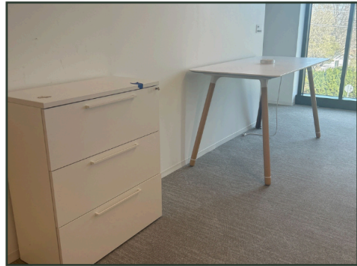
Example of Furniture