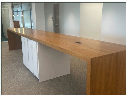
Common Area Furniture